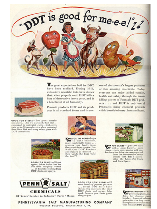
Figure 3. DDT advertisement flyer circa 1950.

Allied soldiers from insect-transmitted diseases. DDT was hailed as the insecticide to solve all insect problems (Figure 3 and Figure 4). The introduction of countless other synthetic organic pesticides followed. These synthetic products launched the modern-day chemical industry and began a new era in pest control.