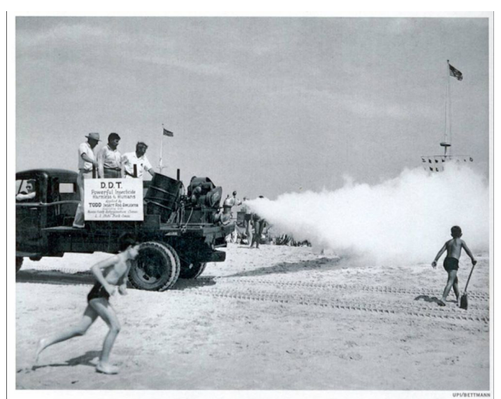
Figure 4. Area-wide DDT application circa 1950.

Given significant success at a relatively low cost, the use of pesticides became the primary means of pest control, providing season-long crop protection against pests and complementing the benefits of fertilizers and other agricultural production practices. The success of modern