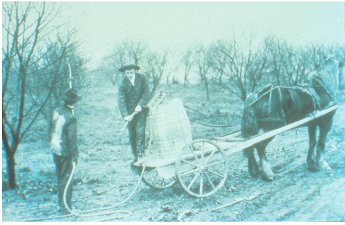
Figure 2. Orchard spraying circa 1900.

Through the years, experimentation and good fortune led to the recognition of additional chemicals with pesticidal activity. Early plant-derived insecticides included hellebore to control body lice, nicotine to control aphids, and pyrethrins to control a wide variety of insects. Lead arsenate was first used in 1892 as an orchard spray (Figure 2).