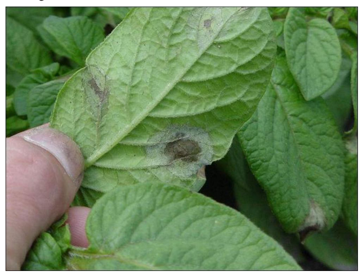
Figure 1. Potato late blight.

nineteenth century. A plant disease called late blight (Figure 1) essentially eliminated potatoes, the staple food crop in Ireland at that time. Up to a million Europeans starved to death during the Great Irish Famine of 1845-1847. Social implications of this pest infestation in Ireland included the largest ever migration to the United States, with more than a million people migrating to this country from Ireland during that famine.