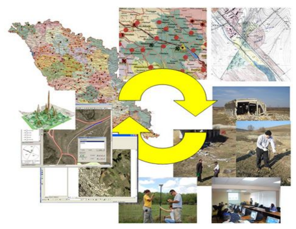
Figure 4. A publicity poster of the GEF/WB Project "Management and destruction of POPs stockpiles"

places/warehouses or contaminated areas are still waiting to be remediate ( cca 1500 ha of land), because of lack of financial resources.