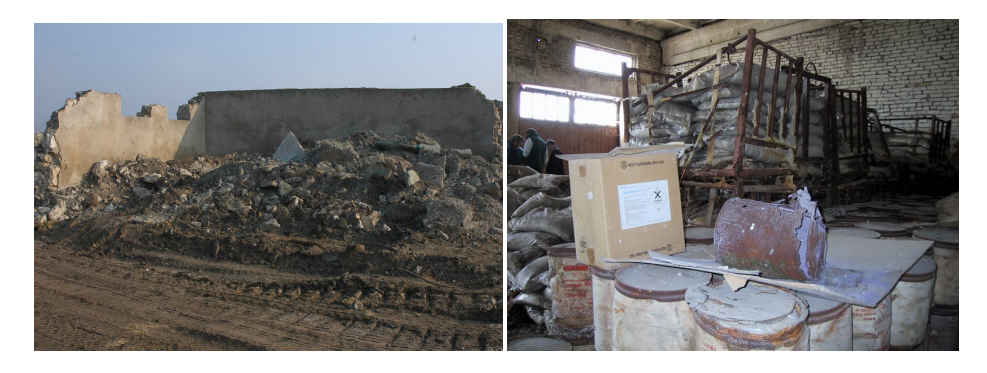
Figure 2. Conditions at typical storage site in the Moldova.

instruction and rules that were developed by the Ministry of Agriculture of the Soviet Union in 1985: "Rules on Pesticides Receiving, Keeping and Delivery at Agricultural Chemistry Storages"; and "Instruction on Collecting, Preparing and Transporting of Old and Banned Pesticides and Their Packages". However, as shown in the examples in the photographs in Figure 2, the warehouses have deteriorated to the stage that there was considerable mixing of different categories of pesticides, both in the solid and the liquids sections. Occasionally, there was even mixing of solids and liquids in the same section. In many cases bags of pesticides had broken and drums of liquids had corroded and were leaking.